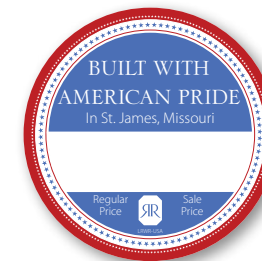
Made in America Wobbler to attach to vacuums