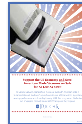
$199 Co-op Ad