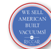
Made in America Button

To help recession-proof your business, call your Riccar representative today at 1-800-2-RICCAR and take part in this exciting promotion.