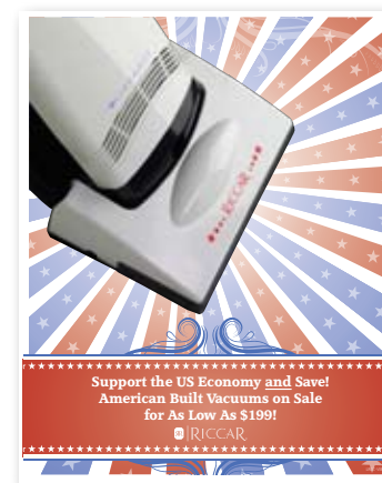
$199 Counter Card