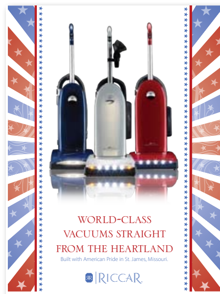
Made in America Poster