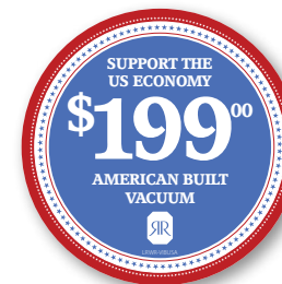
$199 Wobbler to attach to vacuums