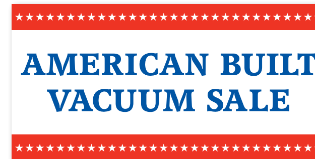
3'x6' Outdoor Banner